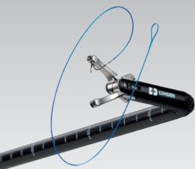
V-Loc™ инструмент ушивания раны