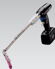
iDrive™ Ultra электрический сшивающий аппарат